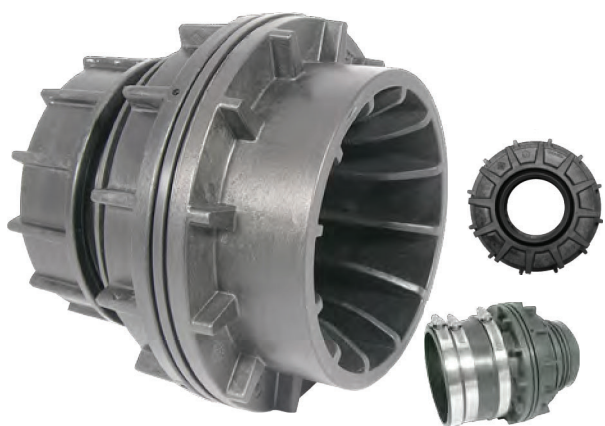
Ducted Entry Boot